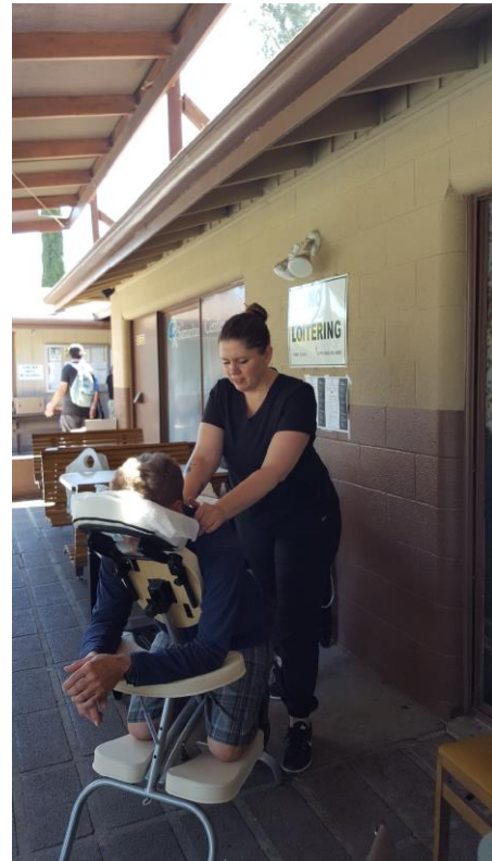
One of the Clients at the Samaritan Center enjoying a chair massage.